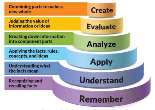
Figure 1: Blooms Taxonomy

(Blooms taxonomy has been given for reference)